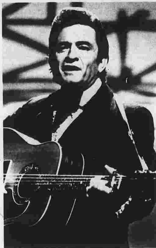
Johnny Cash returns to television starting Wednesday 9-10 p.m. on ABC. Arlo Guthrie is a guest.