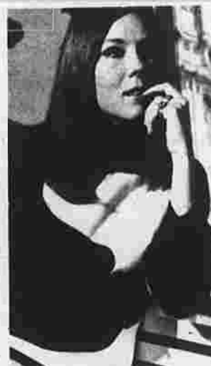
Diana Rigg stars in the drama, "Married Alive," Friday 10-11 p.m. on NBC.