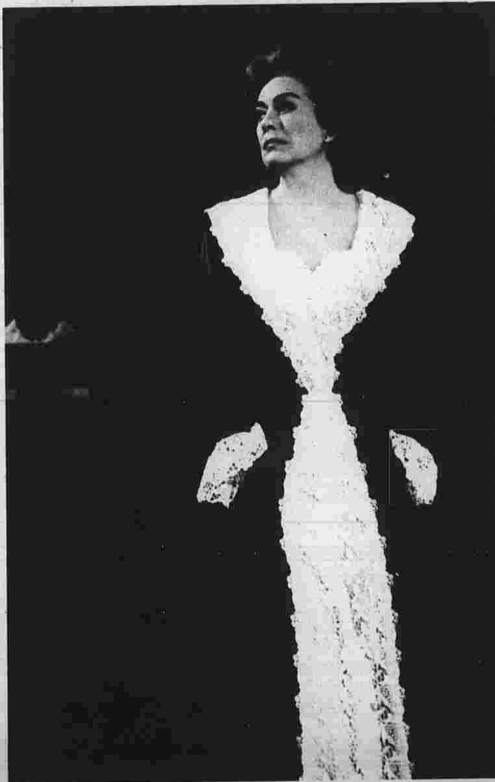
Joan Crawford as a woman greedy relatives try to drive mad to get her husband's estate, in an episode of NBC's "The Virginian" Wednesday 7:30-9 p.m.

L. T. WOOD CO. 51 BISSELL ST. Phone 643-1129 FOR 24-HR. BURNER SERVICE, TEL. 649-3701