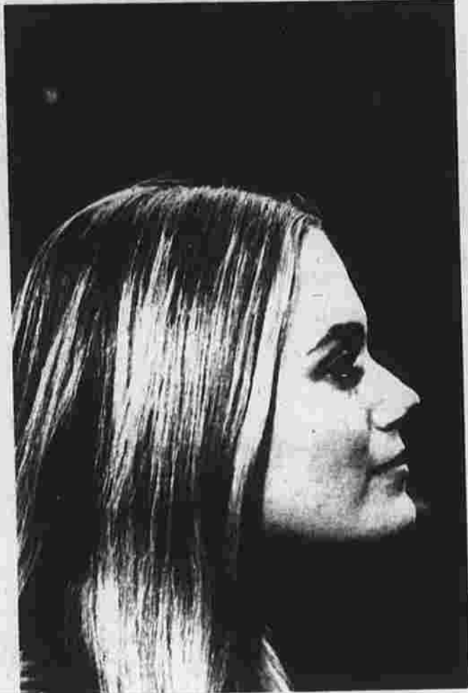
Peggy Lipton of ABC's "The Mod Squad" on Tuesdays.