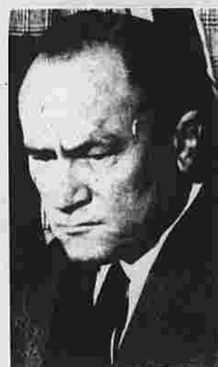
E. G. Marshall on ABC's "Paris 7000" Thursday 10-11 p.m.